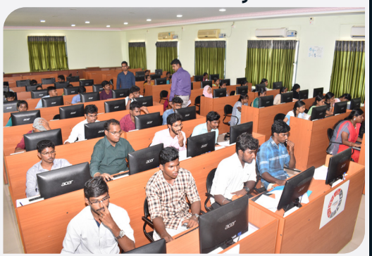
Youth Welfare Department