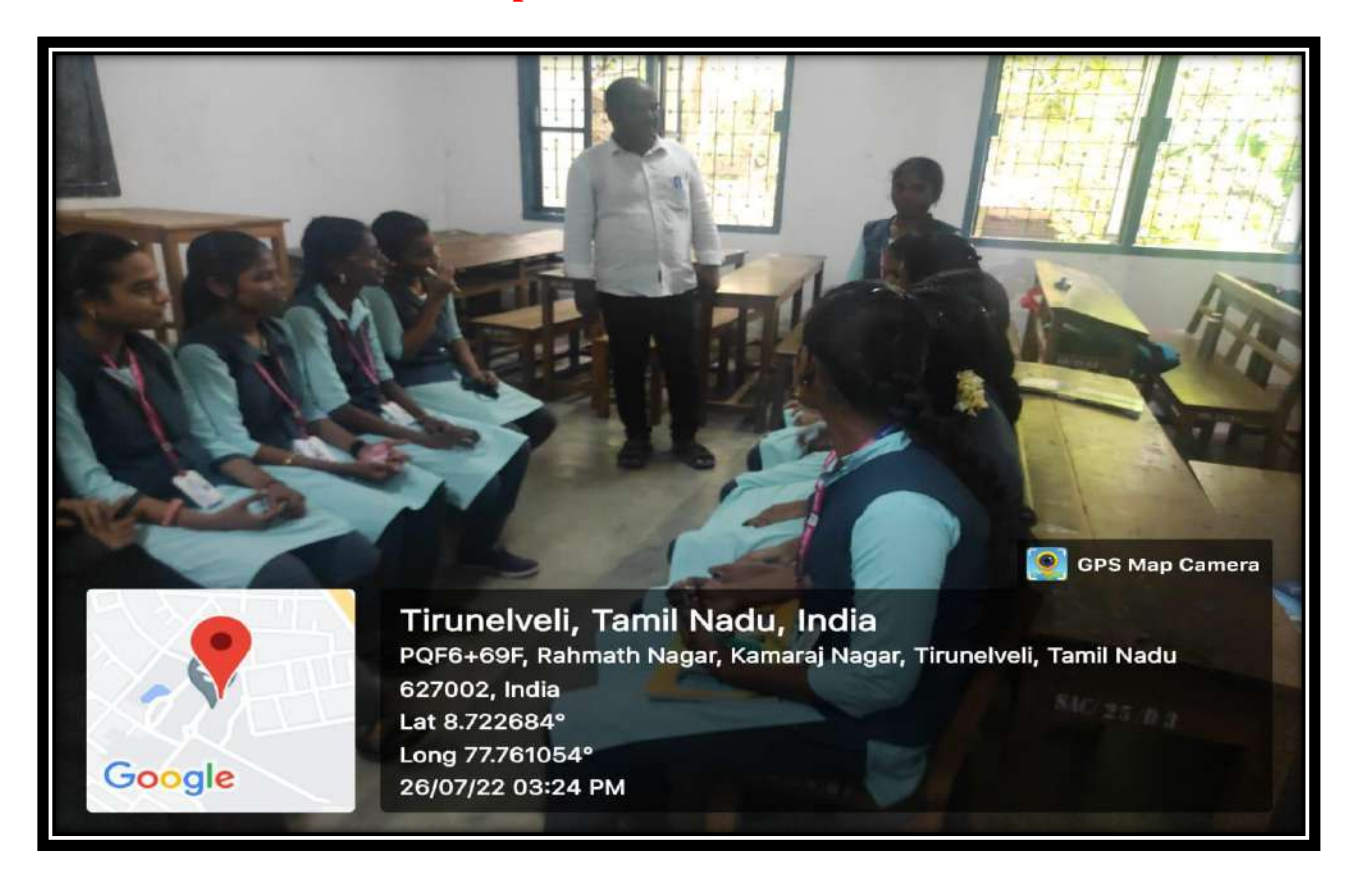
The Department organizing a Group Discussion