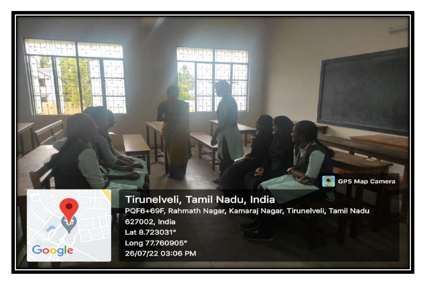
The Students are engaged in a Group Discussion