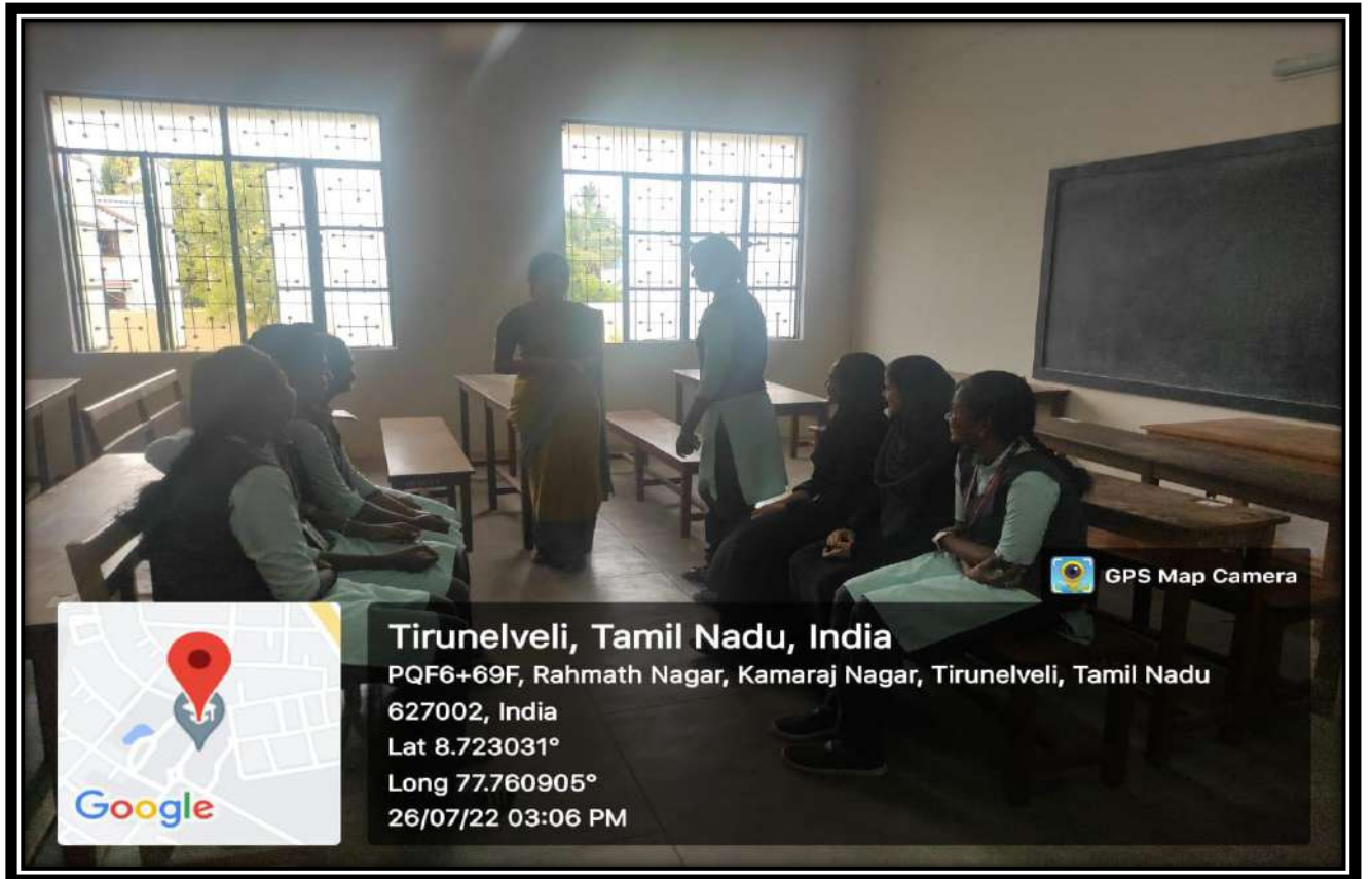
The students are engaged in a Group Discussion