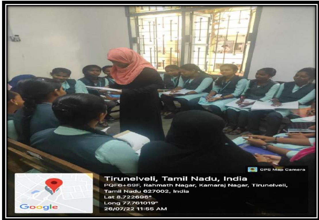
The students take part in a Group Discussion