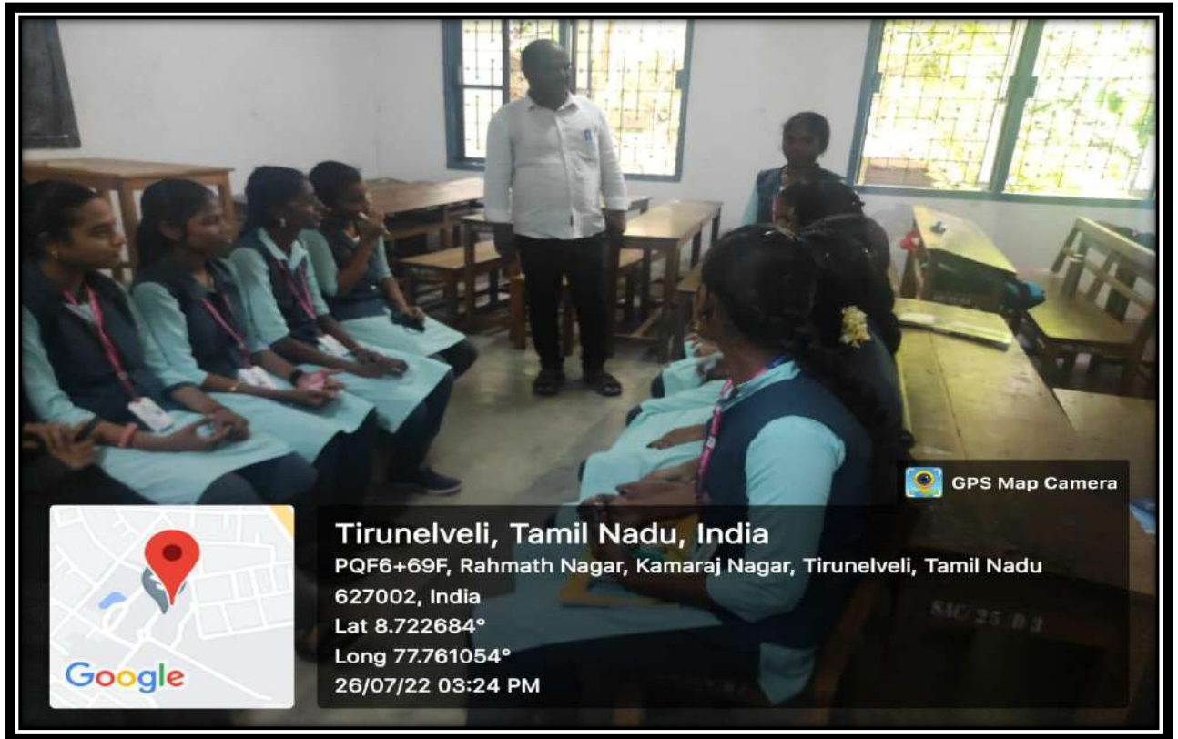
The Department organizing a Group Discussion