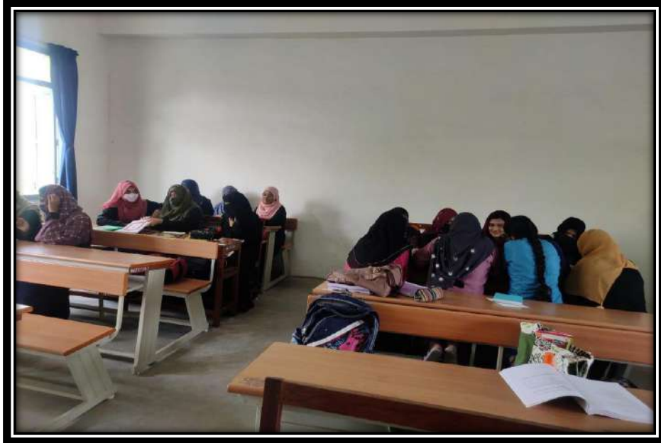
Girls are taking part in a Group Discussion