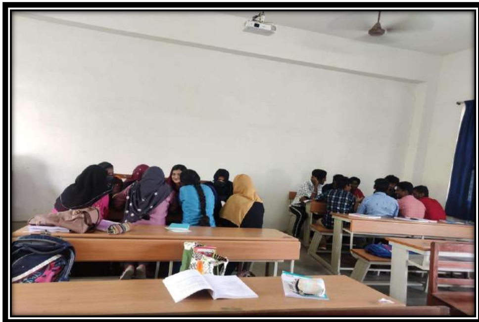
Students participating at a Group Discussion