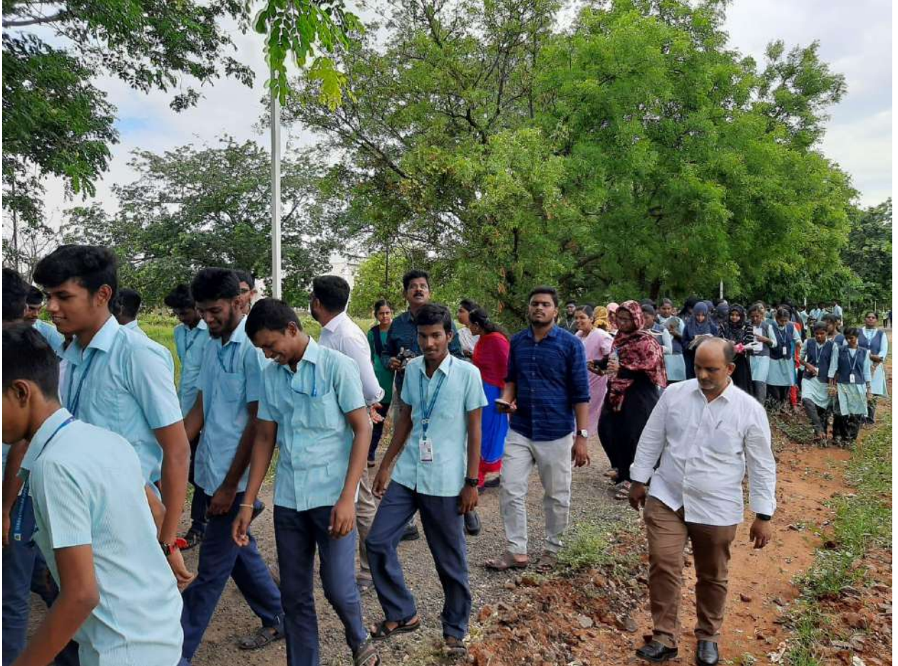
The students are undertaking a field visit