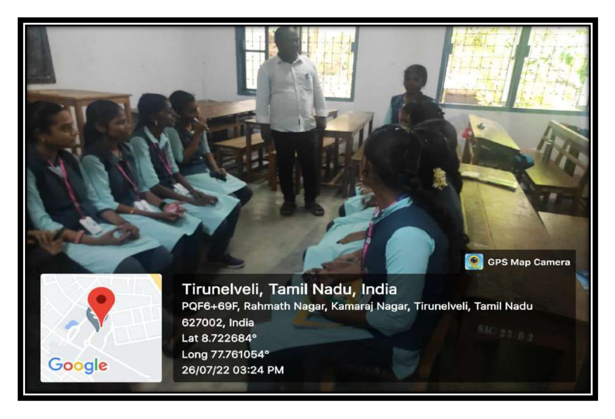
The Department organizing a Group Discussion