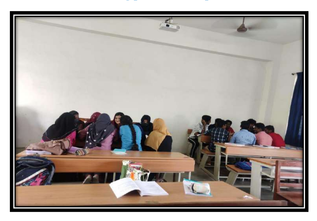
Students participating at a Group Discussion