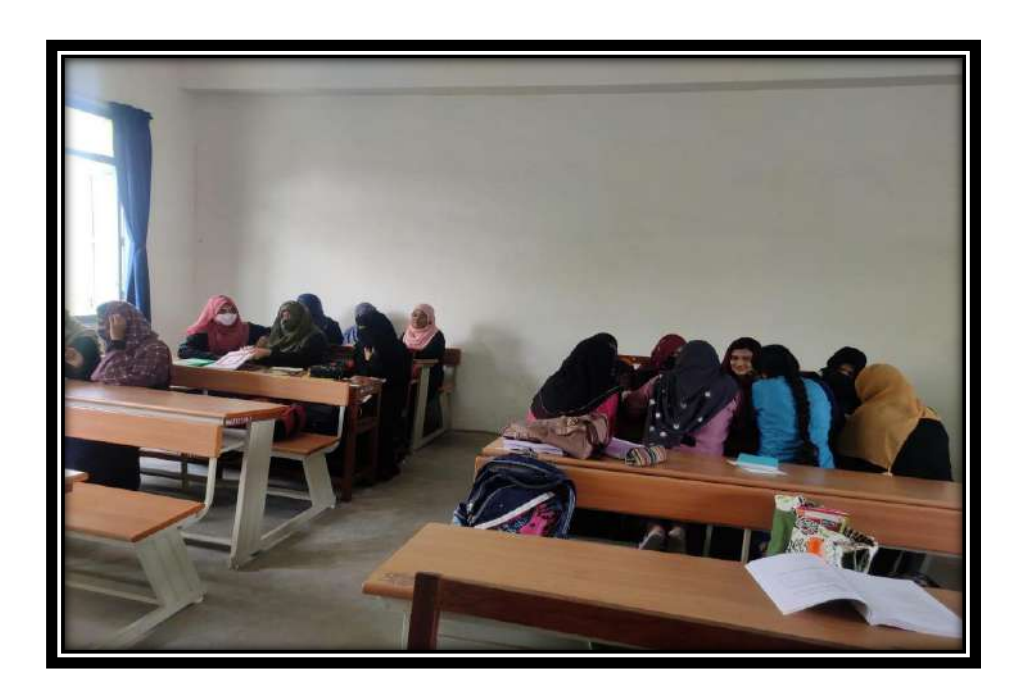
Girls are taking part in a Group Discussion