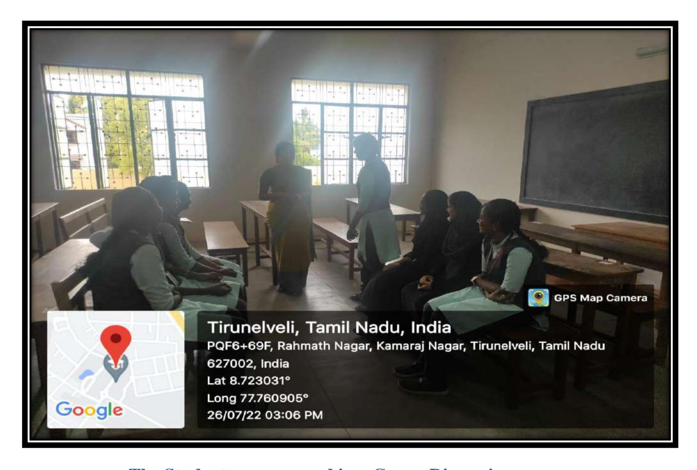
The Students are engaged in a Group Discussion