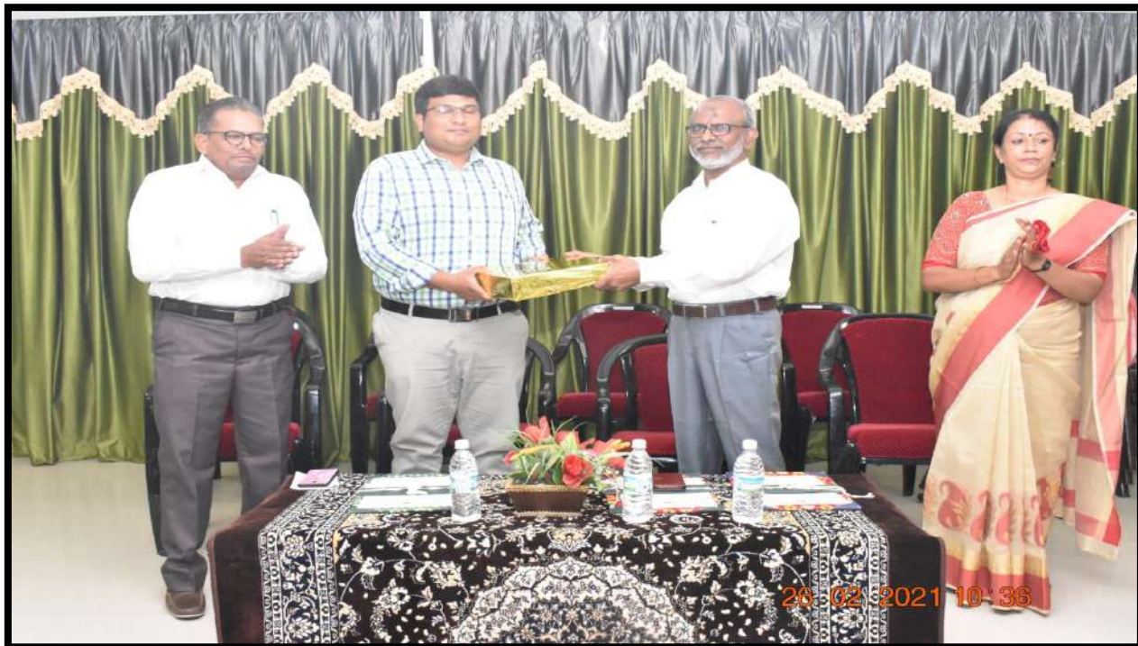
Memento Presentation to the Chief Guest