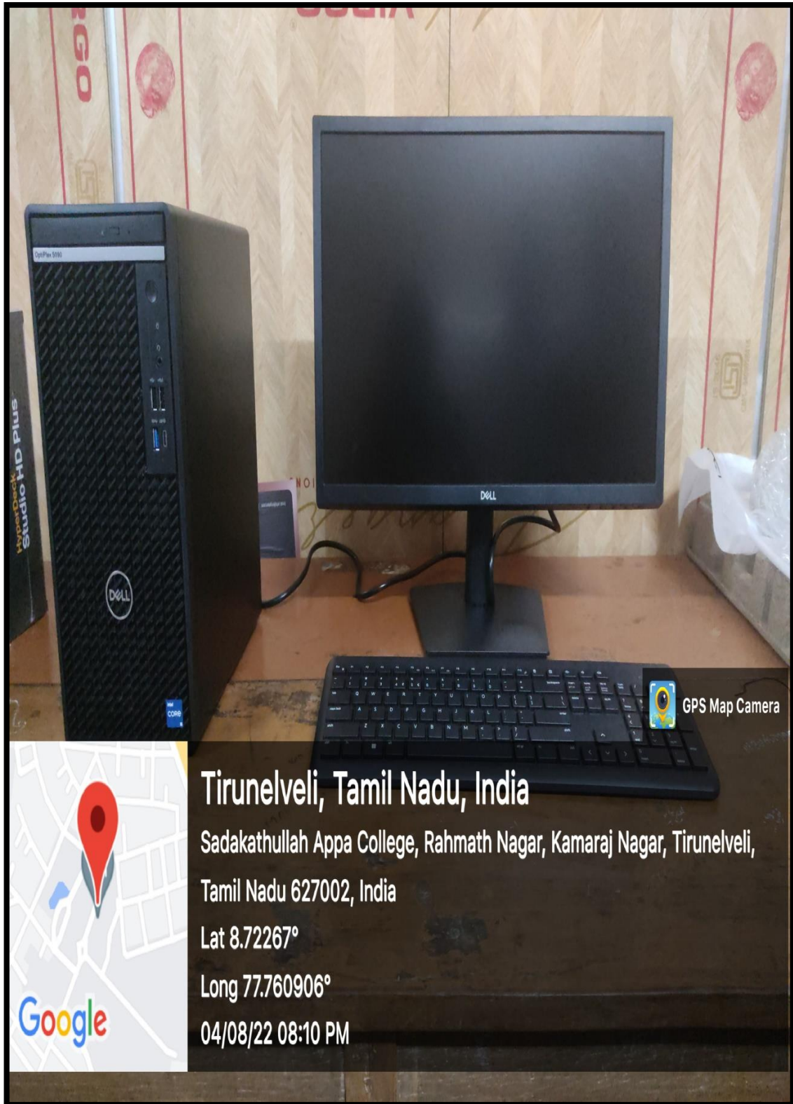
E - Studio Recording System