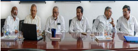
MEMBERS OF GOVERNING BOARD