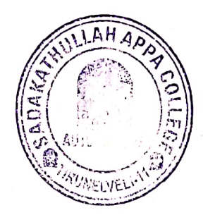
PRINCIPAL SADAKATHULLAH APPA COLLEGE (AUTONOMOUS) Rahmath Nagar, Tirunelveli - 627 011,