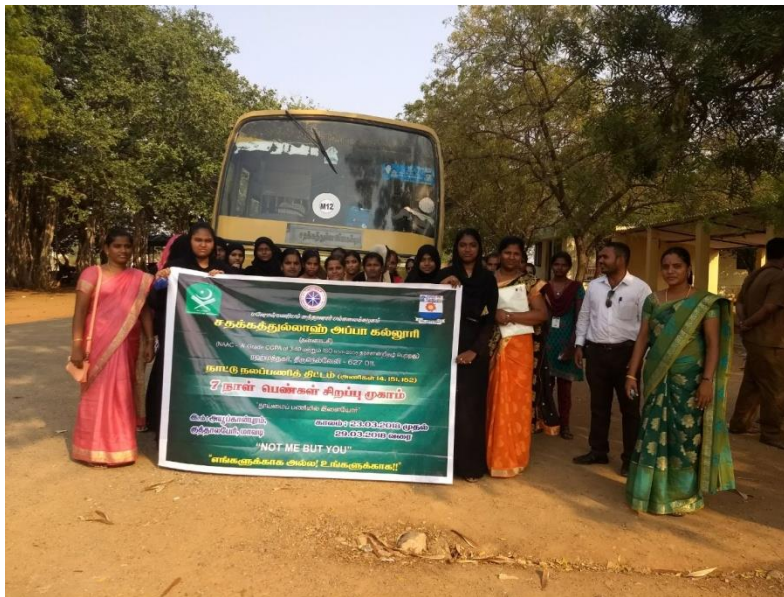
Started from college on 23.03.2018