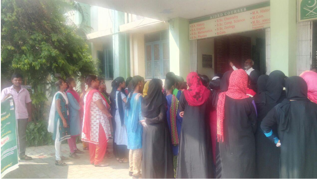
Instruction by our Principal to our students