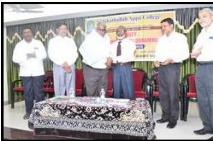
Faculty Development Programme