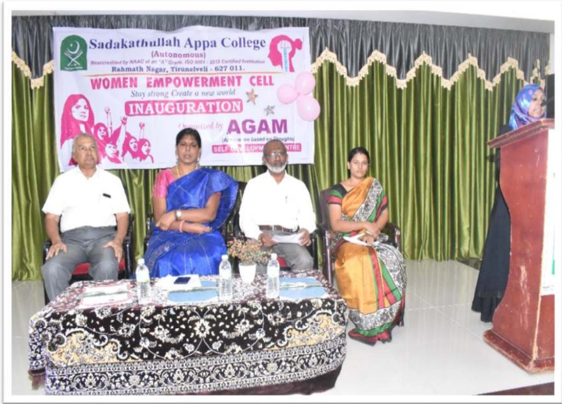
The Chief Guest on the Dias