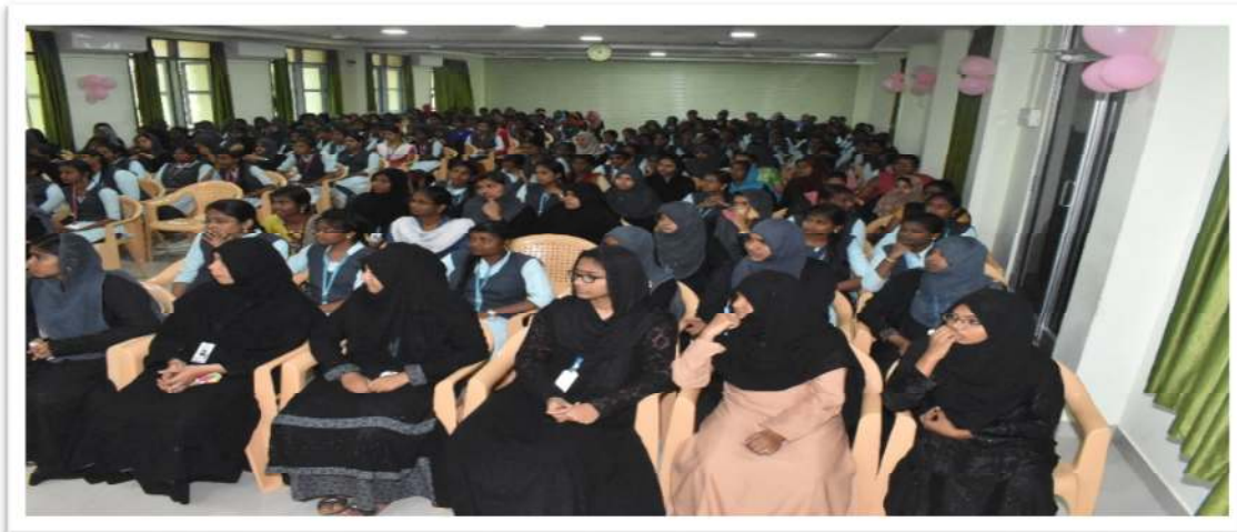
Participants attending the Programme