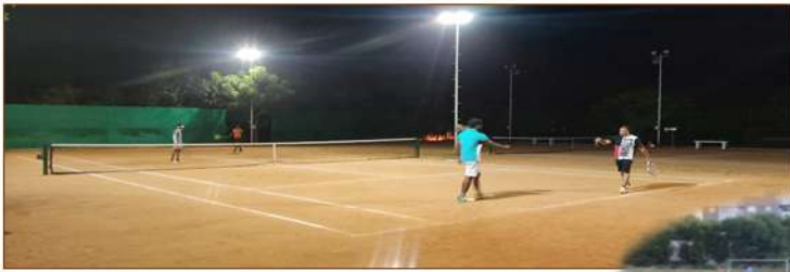
Floodlight Tennis Court