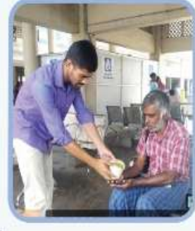
மாணவர்களின் மனிதநேயப் பணிகள்