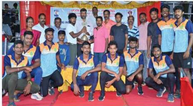
Our College Men's team secured the Overall Championship and the Women's team secured the runner-up position at the Manonmaniam Sundaranar University Inter-Collegiate Athletic Meet 2024.