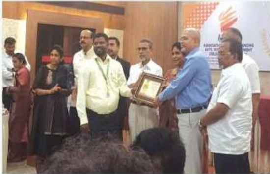
Our Principal receiving appreciation Certificate from Association of Self-Financing Arts, Science & Management Colleges of Tamilnadu (ASFASM) for Securing the 98th Rank in the NIRF Rankings 2024