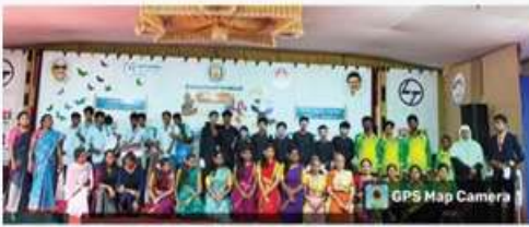
பொருளை நெல்லை புத்தகத் திருவிழாவில் கலை நிகழ்ச்சிகள் வழங்கிய இளைஞர் நலத்துறை மாணவ மாணவியர்.