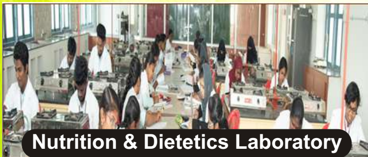
Nutrition & Dietetics Laboratory