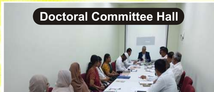
Doctoral Committee Hall