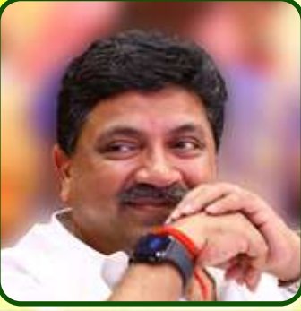
Dr. P.T.R. PALANIVEL THIAGA RAJAN Minister for Information Technology & Digital Services, Tamil Nadu

சிறந்த கல்லூரி பல்கலைக்கழகமாக வாழ்த்துக்கள்.