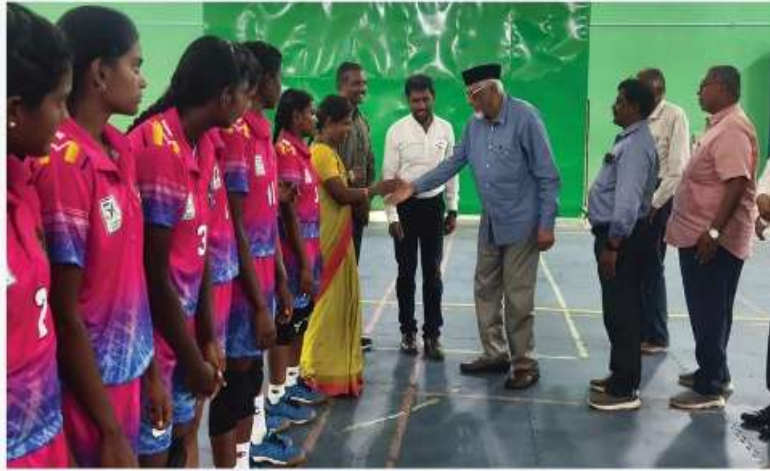
Our Honorable Secretary inaugurating the M.S. University Inter-Collegiate Women's Volleyball Tournament at our College on December 6th and 7th, 2024.