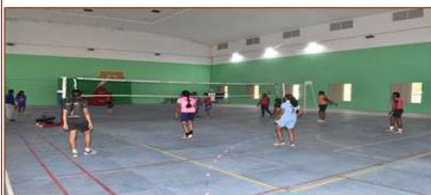
Multipurpose Indoor Stadium