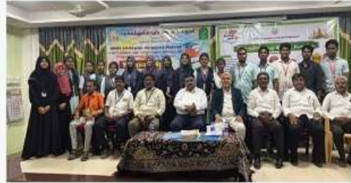
பொருளை இளக்கியத் திருவிழாவில் ரூ.1,60,000/- பரிசு பெற்ற நம் மாணவ மணவியர்கள்.