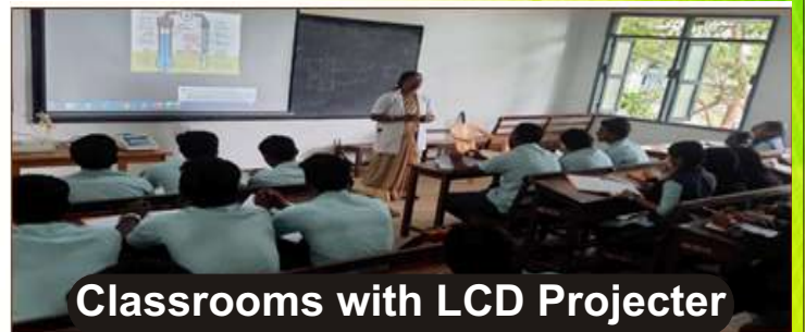
Classrooms with LCD Projector