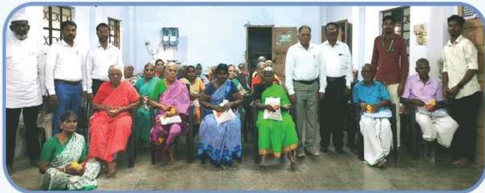
ஆதரவற்றோர் இல்லத்தில் தீபாவளி கொண்டாடும் மனிதநேயர்கள்